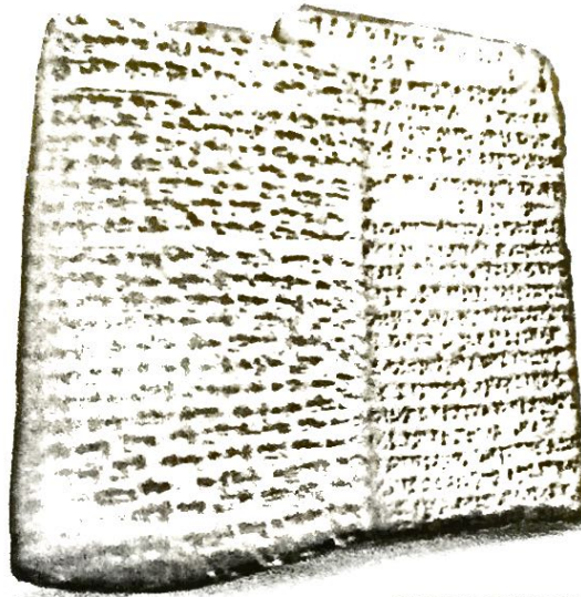
The Amarna letters and the biblical text describe the end of Canaan's primary grain income that Canaan had several territories, various kings, and cities that served as the means of military control.

This collection of cuneiform tablets is named after the place they were discovered—modern Amarna, the ancient Egyptian city of Akhetaten. Written in the late 14th century BC, these letters record correspondence between Egypt (under Pharaohs Akhenaten and Tutankhamun) and its vassal states. They provide information about trade and government of the time.